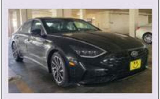
Safe - Reliable - Friendly