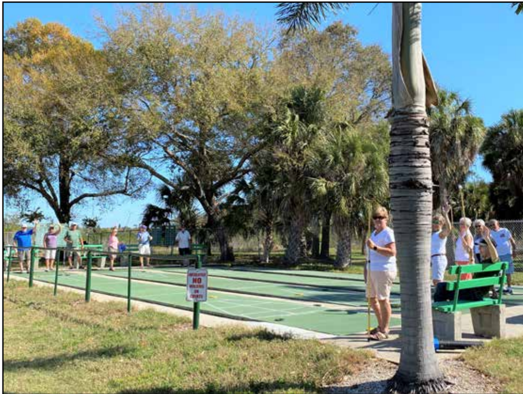
WSV shuffleboarders take a moment from their game to wave hello on a recent sunny Thursday morning.